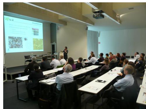
The Second Joint Stakeholder Meeting and Workshop were held in Antwerp, Belgium on 25 March 2011.

The event was aimed at presenting and discussing the overall idea behind the UPSOIL project. Special attention was given to the new reagent delivery system that was demonstrated at a site in Flanders, Belgium. Over 40 people representing consultants and engineers in the field of remediation took part in the meeting.