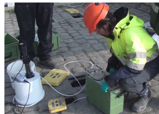
Figure 2 On-line monitoring installation at the Flanders site

The results obtained from the field test in Flanders allowed to evaluate the effectiveness of the chemical remediation process as well as assess the environmental risks and cost – efficiency aspects. For example temporary metal (especially chromium) release was detected during the oxidation of soil matrix. Investigations related to that issue are ongoing. Further interpretation of the results will allow establishing the operational requirements for the technique.