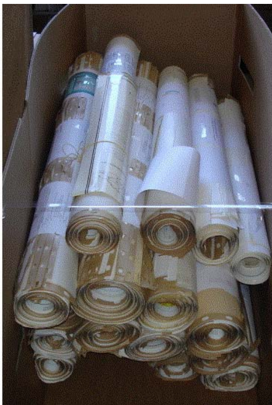
Figure 1: Stored paper soil maps

Beyond data rescue, the archive is expected to develop into a common platform for storing soil maps from around the world and making the information readily accessible. Organisations that maintain soil map archives in paper form, and wishing to conserve this information by transferring it into digital form, are invited to join the EuDASM programme.