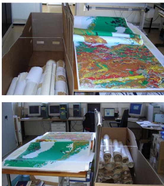
Figure 2: Soil maps of Africa in preparation for digital archiving