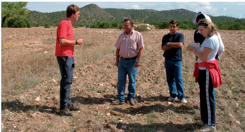
Discussions between researchers and farmers in southern Spain.

A large amount of data will be collected, and integrated soil-water-plant models will be developed and applied, to confirm and discover details of relationships. The models will provide new insights into ecosystems and degradation processes, and help to suggest appropriate land management options. In this way resilience to climate change, disasters and other risks may be enhanced.