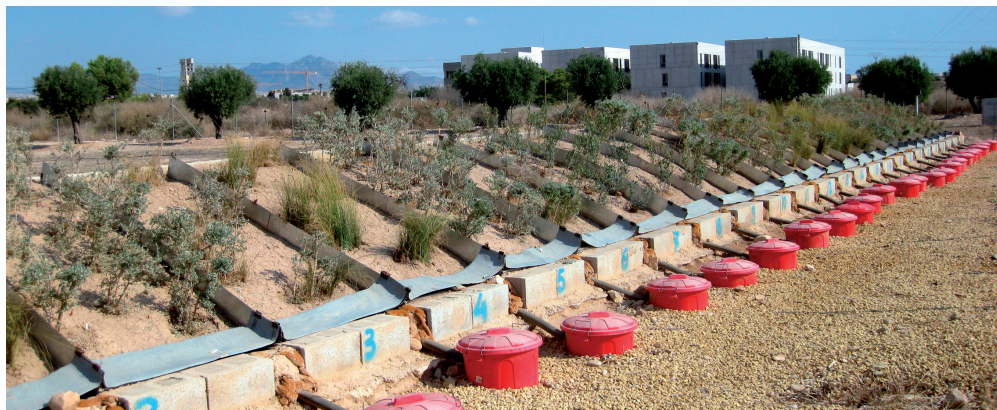
Plant and soil experiments to compare treatments on a constructed slope (Photo: Larger scale experiments A.M.Urgeghe)