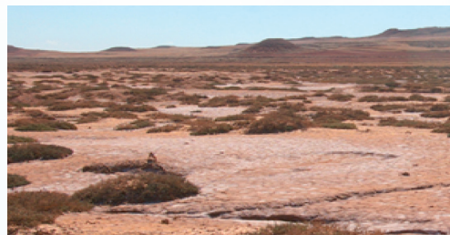
What causes a "healthy" pattern of vegetation (left) to shift to a degraded landscape?