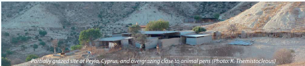
Partially grazed site at Peyia, Cyprus, and overgrazing close to animal pens

Under some conditions, ecosystems may seem to remain the same, inert to increasing pressures, until a threshold is passed. In these instances, the vegetation composition may change suddenly. In extreme cases, vegetation may even be lost altogether. Changes in ecosystems are often difficult to understand or predict, but, for example, fragmentation or loss of vegetation cover, and evidence of soil erosion and land degradation, may indicate a threshold is almost reached. When there is a particularly rapid transition of the ecosystem from one state to a new state (maybe a different vegetation structure or species composition) with important ecological and economic consequences, it is known as a "catastrophic shift" or "sudden shift". The study of these "thresholds", "tipping points" and "sudden shifts" in dryland ecosystems is the core of current research in the CASCADE Project.