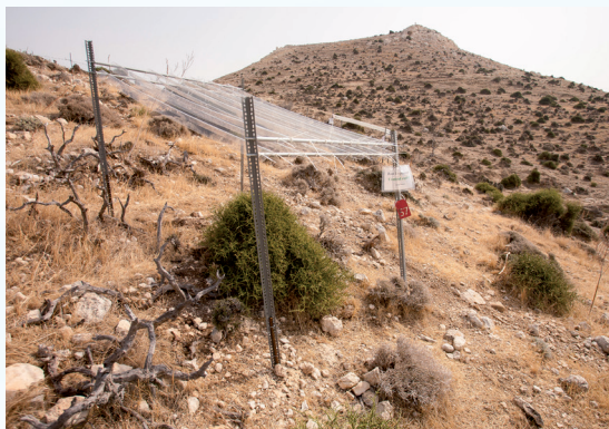
Rosmarinus Officinalis (K. Themistocleous) and Rainfall exclusion roof to simulate drought