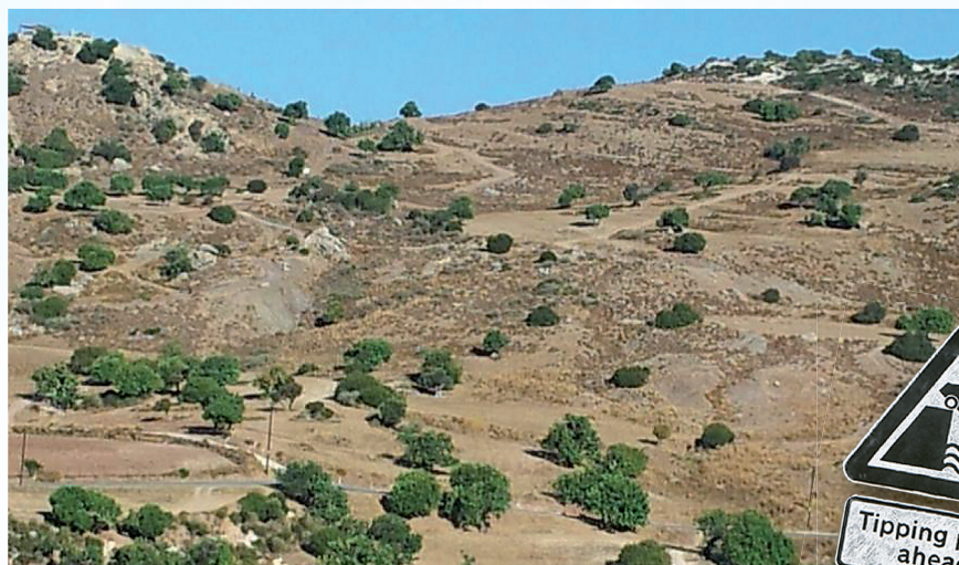
Partially degraded landscape, Peya, Cyprus

CASCADE research partners are looking forward to pooling their expertise and making the most of experimental opportunities. The ultimate aim is to prevent sudden shifts in dryland ecosystems. This is in accordance with international efforts, specifically from the United Nations Convention to Combat Desertification (UNCCD). The UNCCD are committed to global restoration of degraded areas and avoidance of further land degradation. CASCADE will help to support the UNCCD's aim for a "land-degradation neutral world".