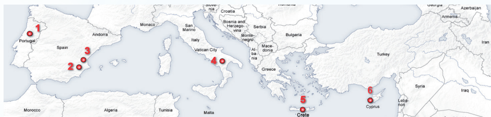
The CASCADE study sites: 1 = Caramulo mountains, Portugal - 2 = Albutera range, Alicante, Spain - 3 = Ayora and Mariola ranges, Spain - 4 = Castelsaraceno, Italy - 5 = Messara valley, Crete - 6 = Pegia, Paphos, Cyprus

CASCADE will look at six study areas in southern Europe where ecosystem shifts have occurred or are likely to occur, with associated consequences for the vegetation, the animals, and the people living there. The locations of these areas are shown below.