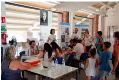
JRC soil awareness event @ Expo Milano, August 2015