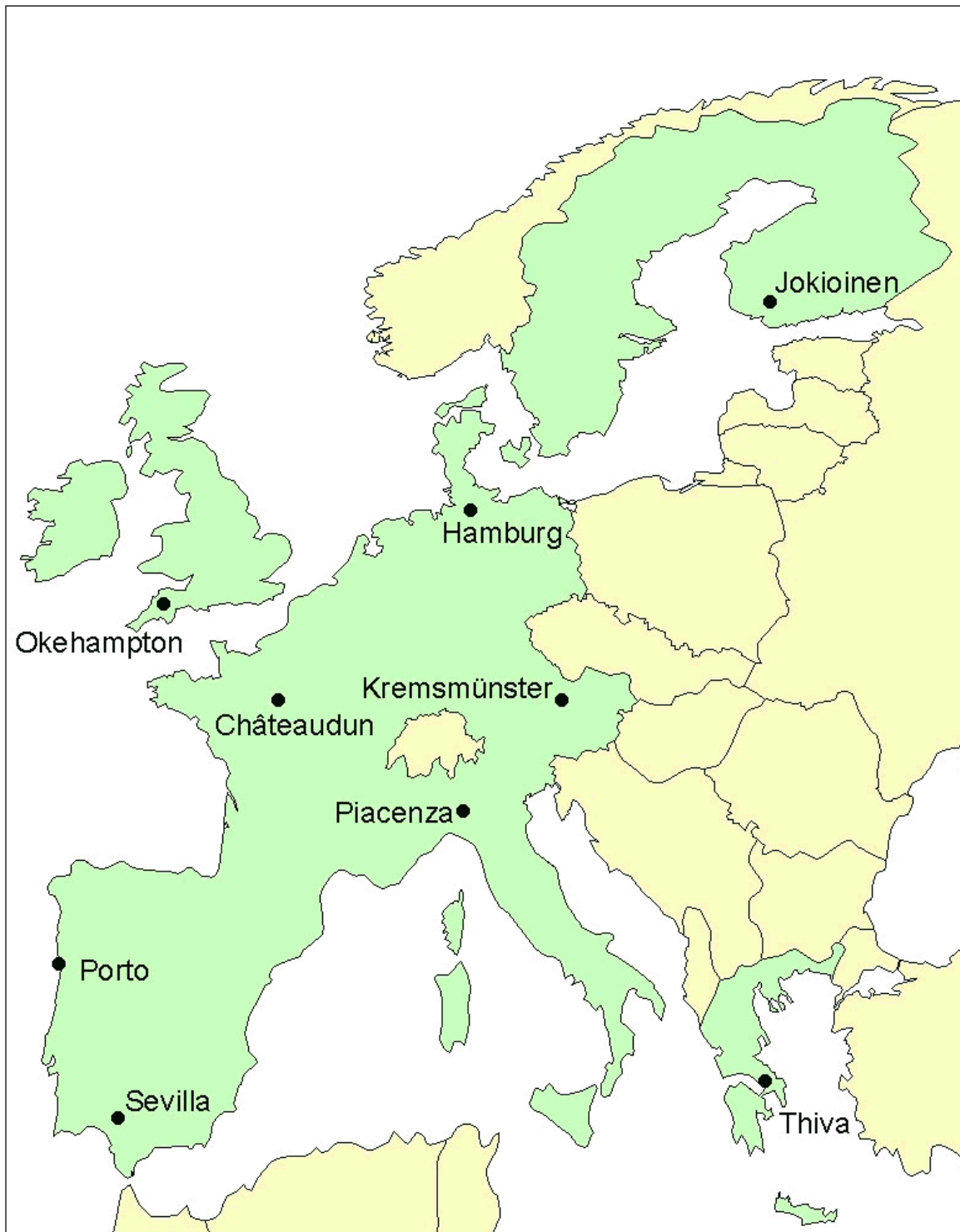
Figure 1.1. Location of the ground water scenarios.

The arable and total land area data in Table 1.1 is based on the work of Knoche et al. , 1998. Temperature and precipitation boundaries were determined based on weather data of about 5000 stations in Europe from Eurostat (1997) and agricultural use was based on information from USGS et al. (1997). As a check, the same area data was also estimated using a